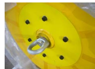
Fitting with Swivel